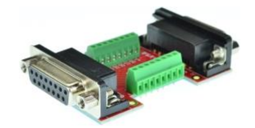
Figure 3: D15-M-V1A with headers